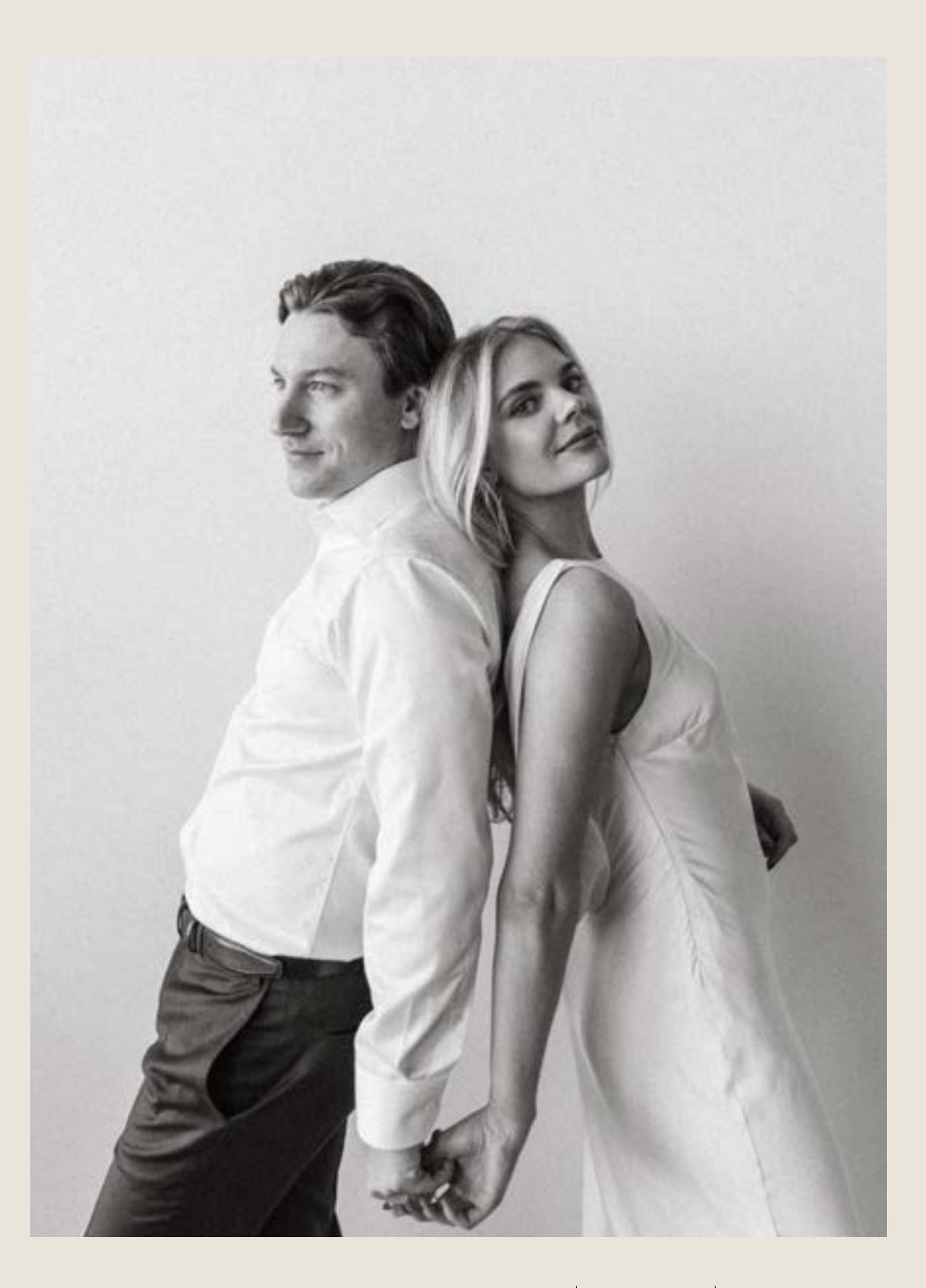
2025 investment guide